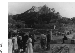
Archaeological digs in 1936

The first inhabitants settled here in the 6th and 7th centuries B.C., protected by a dry-stone rampart blocking the road to the Alpilles for